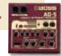
AD-5 Acoustic Instrument Processor

Comprehensive Acoustic-Electric Tone Shaping. The BOSS AD-5 gives acoustic-electric guitar and bass players rich, full "miked" acoustic sounds. Anti-Feedback control and specialized effects including 4-band EQ, plate-style reverb and bi-stereo chorus.