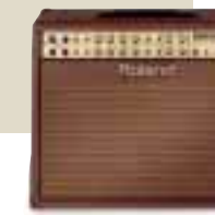
AC-100 Acoustic Chorus™ Guitar Amplifier

100 Watts of Clean, Acoustic Tone. This 100-watt amp uses a special tri-amped, three-speaker configuration to deliver clean and powerful sound—complete with the acclaimed Roland chorus effect.