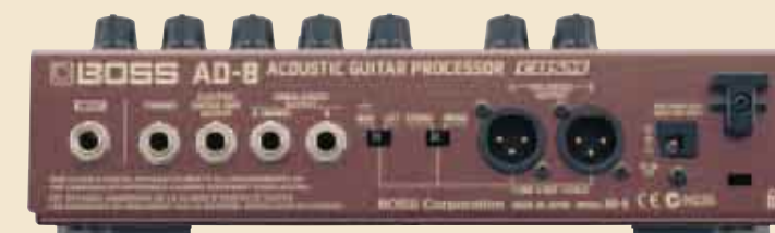
■Rear Panel The AD-8's balanced XLR outputs are perfect for connecting to PA systems and professional recording gear.

The AD-8 comes with unbalanced stereo outputs, an Electric Guitar Amp output, and a pair of balanced XLR outputs. These balanced XLR's are true DI-complete and include a ground lift feature for eliminating hum.