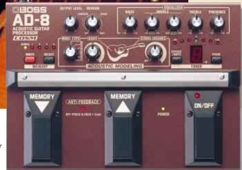
AD-8 Acoustic Guitar Processor COSM