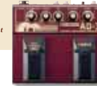
AD-3 Acoustic Instrument Processor

The Perfect Partner for Acoustic-Electric Gigs. The AD-3 puts the AD-5's groundbreaking acoustic processing technology—along with anti-feedback processing, reverb and chorus effects—into a rugged, floor-based unit with stompbox simplicity.