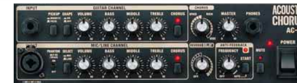
■Top Panel The AC-60's two input channels let you connect two guitars, or a guitar and microphone.