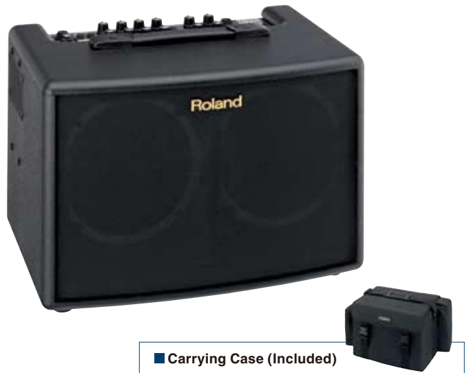
■ Carrying Case (Included)

*Control panel and rear panel are identical to AC-90.